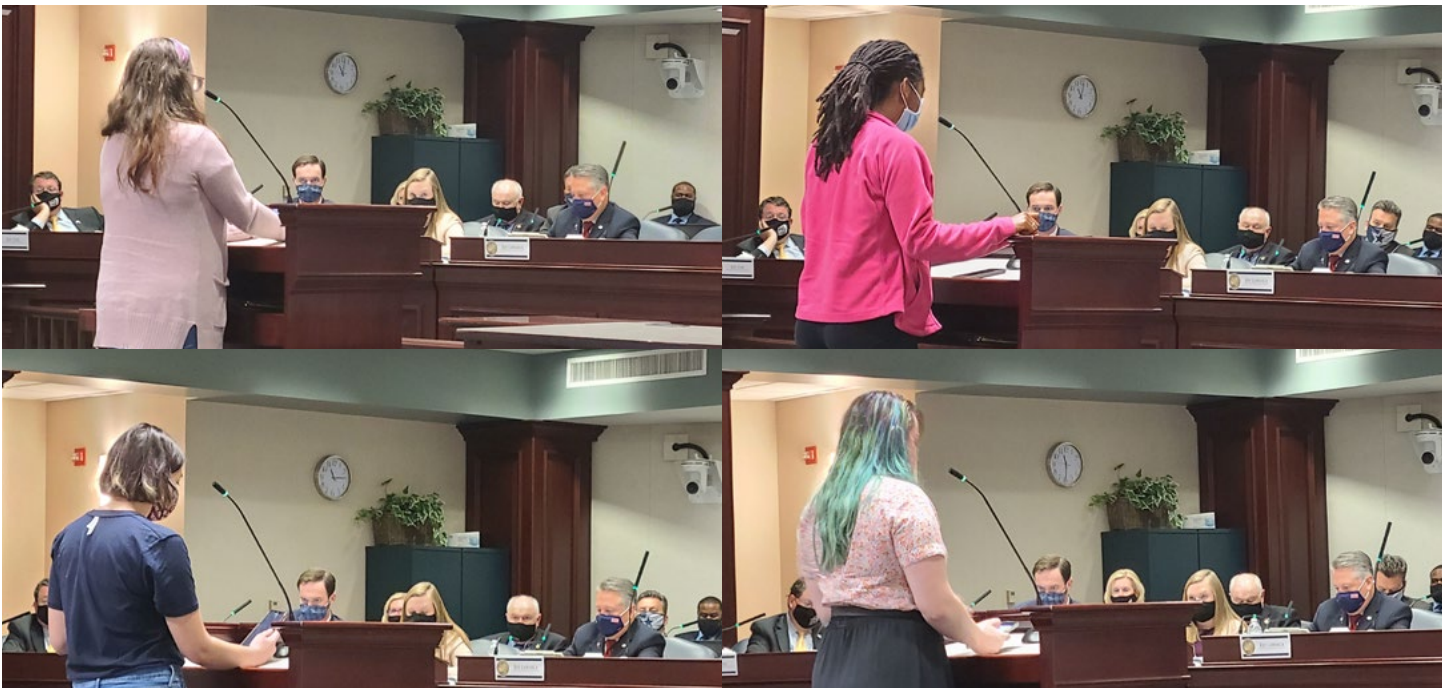
Volunteers testifying against HB 545, the Ant-Sex Education bill in the House Education and Employment Committee.