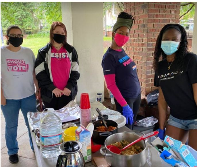
FSU Generation Action at a Food Not Bombs food share in Tallahassee.

STATUS: The Florida Alliance of Planned Parenthood Affiliates is neutral on the amended version that ultimately passed in both chambers.