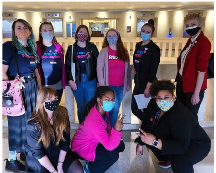
Volunteers and staff at the state capitol to testify against HB 545.